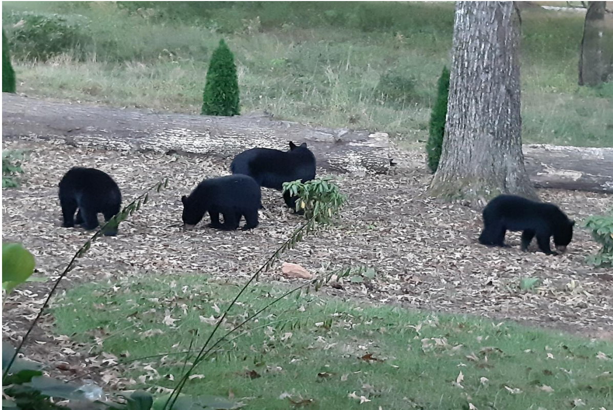
MOTHER BEAR WITH HER THREE CUBS

The bears in our area are extremely healthy, naturally well fed and their breeding reflects that. Their diet does not (and should not) include any supplemental food items from human sources.